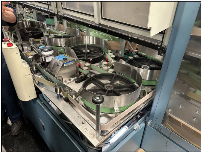
Both Left: The inner workings of the Facer Canceller Machine.