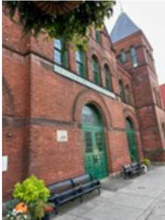
York Central Market House 1888